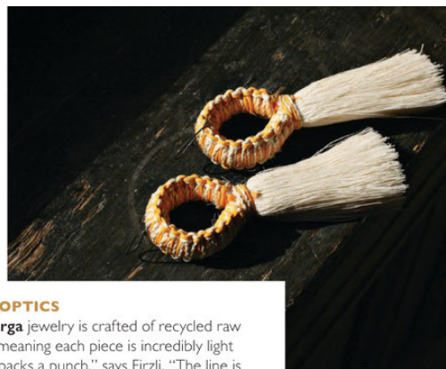
Tribute stocks wares from around the globe, including jewelry from Avocet.