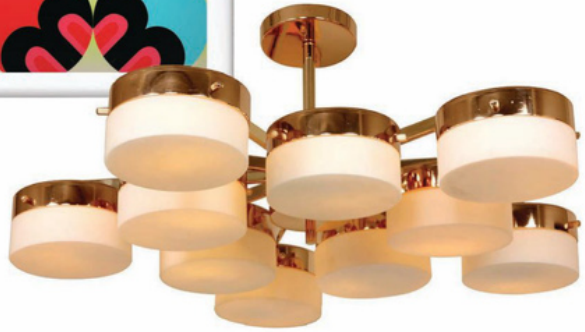
SPOTLIGHT CHIC "I wake up happy every day. One way to maintain that good mood is great lighting, and a lot of it," says Elkayam. "This ceiling light is not only decorative, but it also gives off a lot of soft light. And for your dinner party, dim it and be done." $1,600, Urban Loft, Bethesda, urbanloft.com