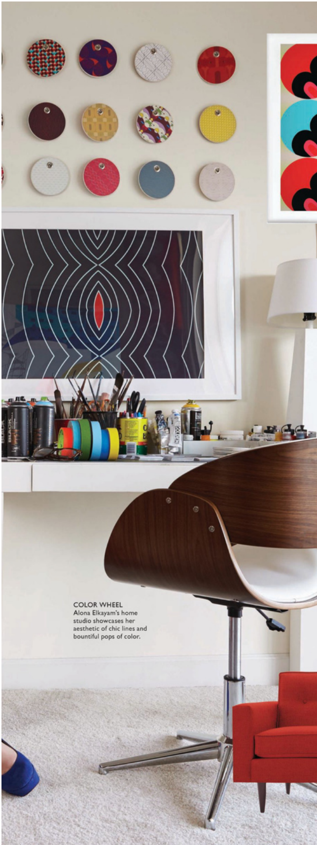
COLOR WHEEL Alona Elkayam's home studio showcases her aesthetic of chic lines and bountiful pops of color.