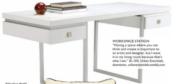
WORKSPACE STATION "Having a space where you can think and create is important to an artist and designer, but I want it in my living room because that's who I am." $1,100, Urban Essentials, downtown, urbanessentials.weebly.com