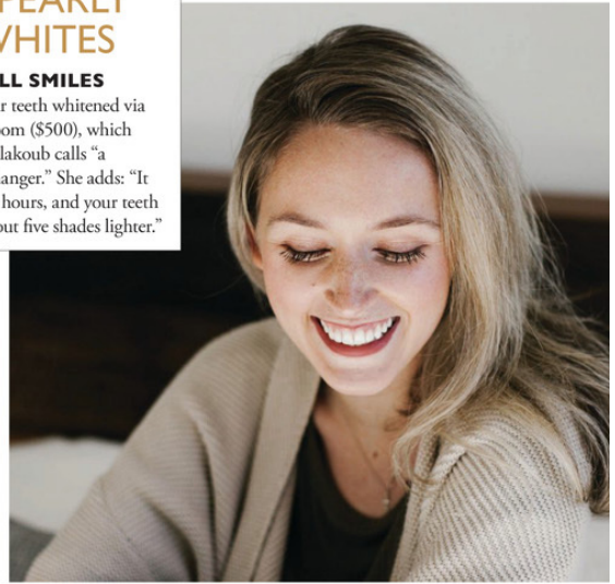
BOTOX PHOTO BY VALIAVA/ISTOCK PHOTO; TEETH WHITENING PHOTO BY LAUREN EDMONDS/ISTOCK; EYELASH PHOTO BY ISTOCK PHOTO; FACIAL PHOTO BY TRIOCEAN/ISTOCK PHOTO

Get your teeth whitened via WeZoom ($500), which Talakoub calls “a game-changer.” She adds: “It takes two hours, and your teeth will be about five shades lighter.”